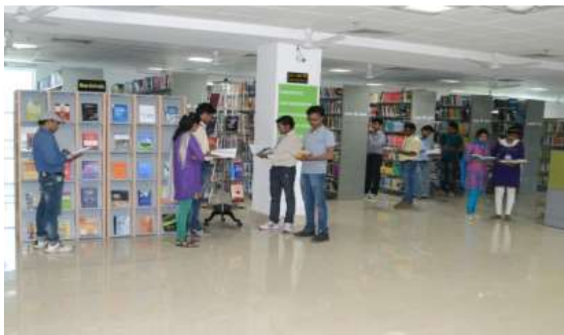
Figure 2: Stack Area