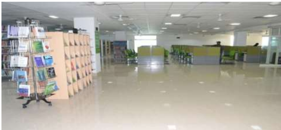
Figure 3: Reading Section