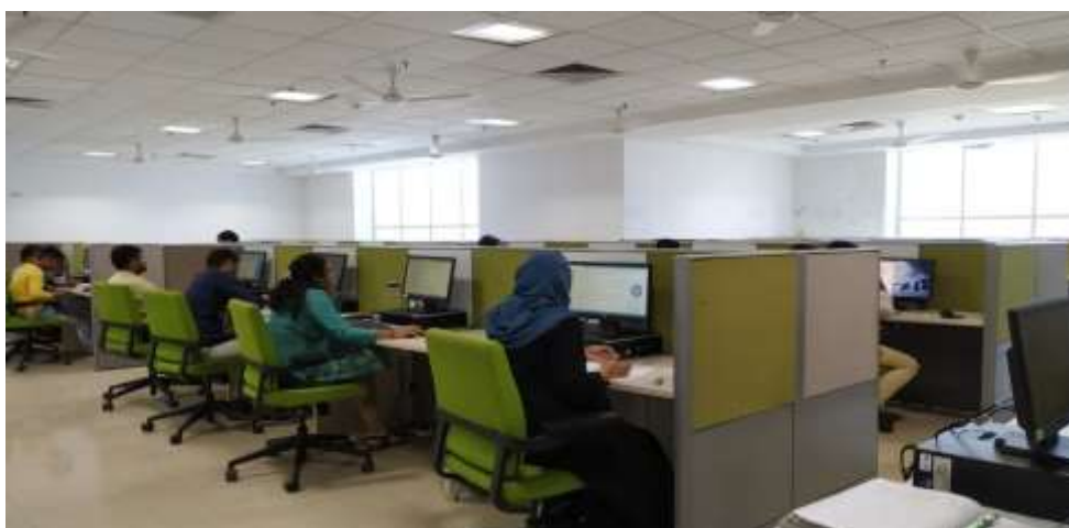
Figure 4: Cyber Section