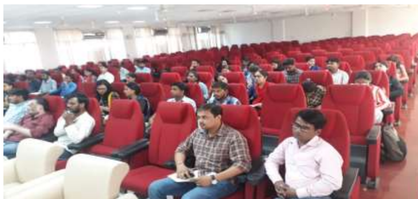
Figure 5: Information Literacy Training

4.3 Information Literacy Program: The GBL organizes information literacy program for UG, PG, M.Phil. and Ph.D. students of the University.